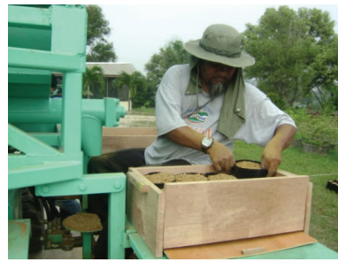
(b) Loading the filled polybags in a wheelbarrow.