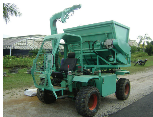
Figure 3. The prototype machine system is mounted on a 4WD prime mover.