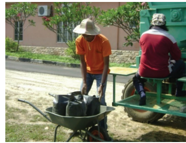
(e) Transporting the emptied wheelbarrow to the machine.