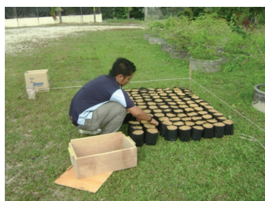
(d) Unloading and arranging the polybags at seedling placement location.