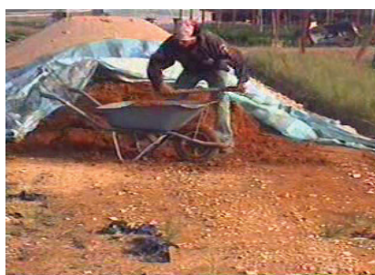
(a) Breaking soil clods and delivering the soil to the filling area with a wheelbarrow.

Time for arranging the working area with wooden planks refers to the total time when the worker starts arranging the borders of the working area with available wooden planks. In the nursery, the working area for this operation has been already bordered by wooden planks. The workers are required to do a minor arrangement of the wooden planks before starting the actual work tasks. Time for breaking the soil clod and delivering the soils with a wheelbarrow refers to the total time when the worker starts breaking soil clods at the soil heap area and delivering the soils on the ground at the filling area. Filling polybags with soil refers to the total time when the worker starts filling a polybag with soil until it is filled. Planting germinated seeds refers to the total time when the worker starts planting a germinated seed in a polybag until it is completely planted.