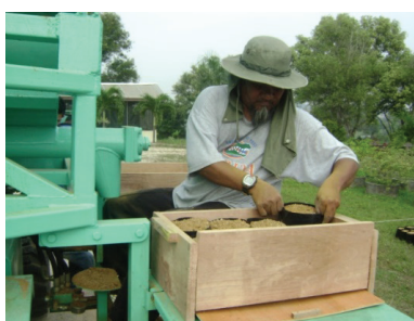
(b) Loading the filled polybags in a wooden tray.