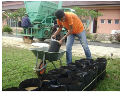
(d) Unloading and arranging the polybags at the seedbed.