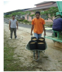
(c) Transporting the loaded wheelbarrow to the seedbed.