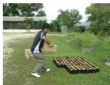
(c) Carrying the loaded wooden tray to the seedling placement location.