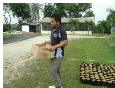
(e) Carrying the empty wooden tray back to the machine.