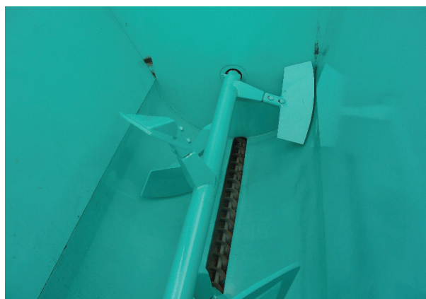
Figure 4. The mixing agitator is on top of the screw delivery auger in the hopper.

Screw delivery auger. The screw delivery auger was designed to deliver the planting media out from the hopper at the required discharge rate into an awaiting polybag that is located at the outlet end of the screw deliver auger chute. The rotating power for this 6 cm diameter size and 7.5 cm pitch screw delivery auger is provided by the Ronzio-6 tandem gear pump with 6.28 cm 3 rev -1 displacement at 300 bar continuous pressure that was also connected in tandem to the Sauer Danfoss Series 40 main pump of the 4WD multipurpose prime mover. The rotating power from the hydraulic motor was then made to run a worm-type reduction gear with a 1:5 reduction ratio and a sprocket-chain drive system with a 1:2 reduction ratio to provide a final screw delivery auger rotational speed of 150 rpm. The screw delivery auger was operated by controlling the Ronzio-6 tandem gear pump through a foot pedal level located in the closed vicinity of the machine operator seat.