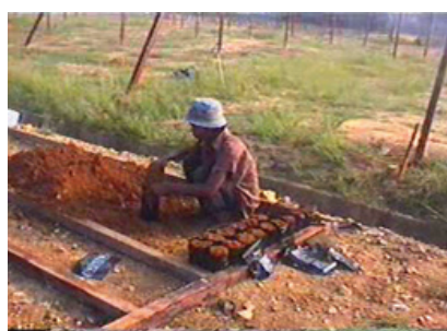
(b) Filling polybags with soil.