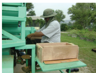
(a) Filling polybag with soil.