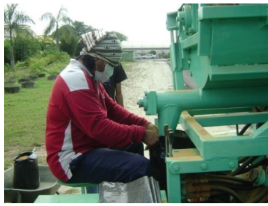
(a) Filling polybag with soil.