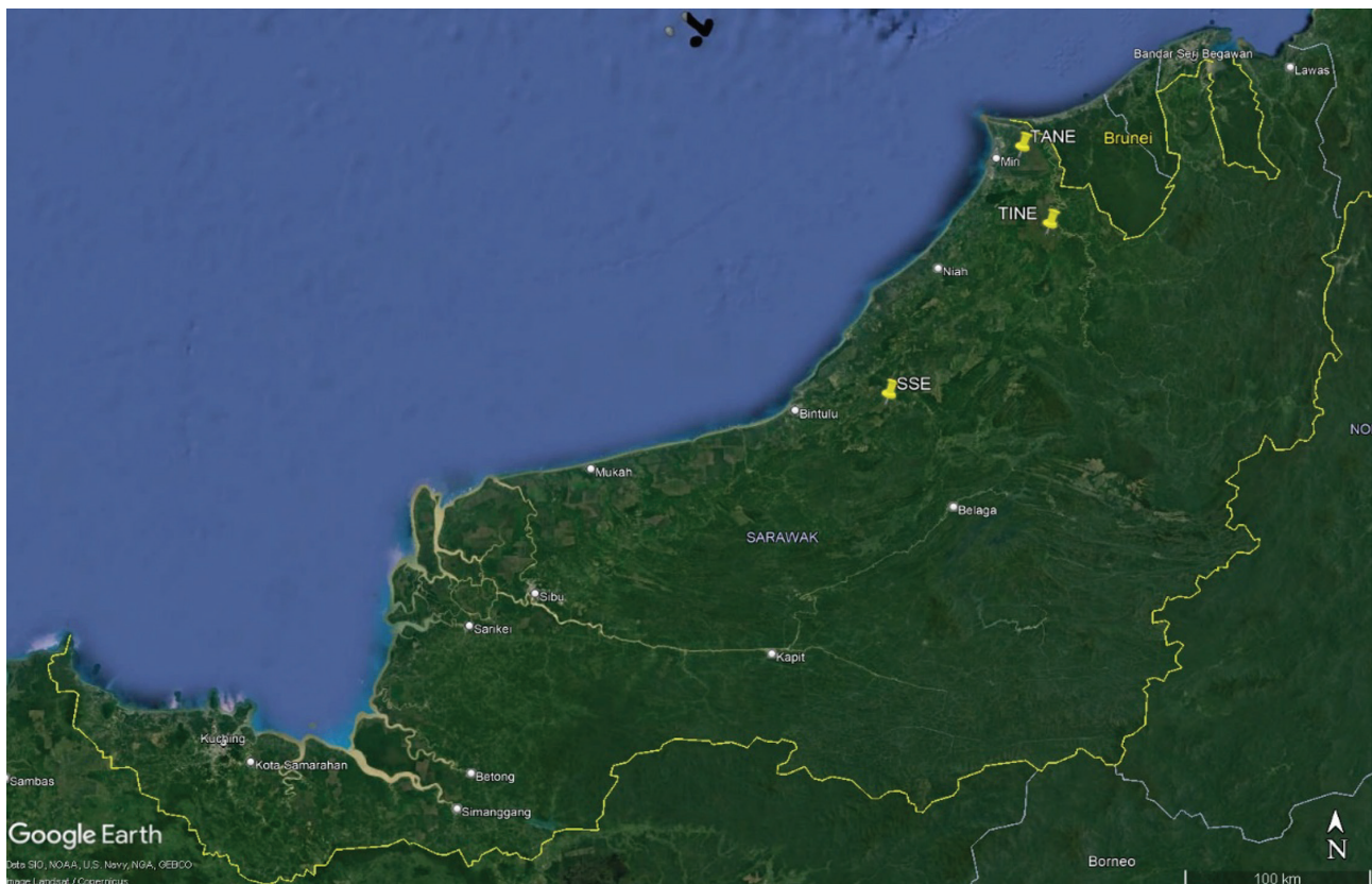
Figure 1. Location of three oil palm estates in Northern Sarawak, Malaysia.

Relative abundance was used to determine the percentage of each bird species in each area by dividing the number of species. The relative