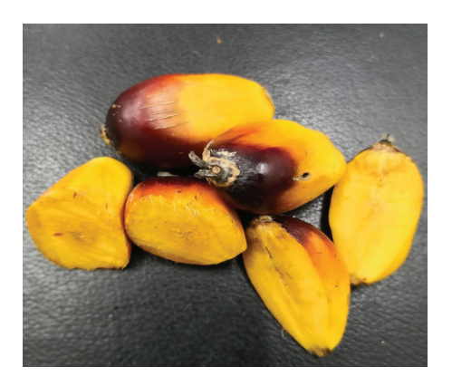
Figure 5b. Parthenocarpic fruitlets: fully formed fruitlets without kernel and nut.

Roslan, 2002) was calculated based on the following formula: