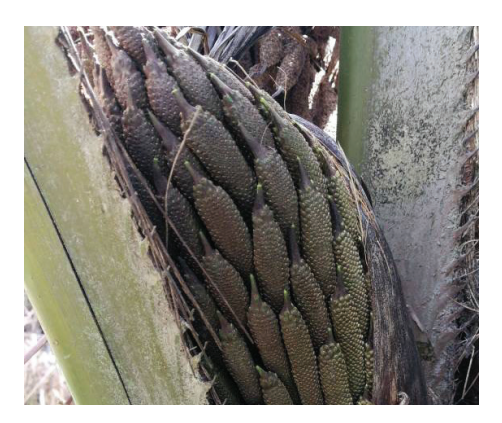
Figure 1b. Light to clean oil palm male inflorescence.