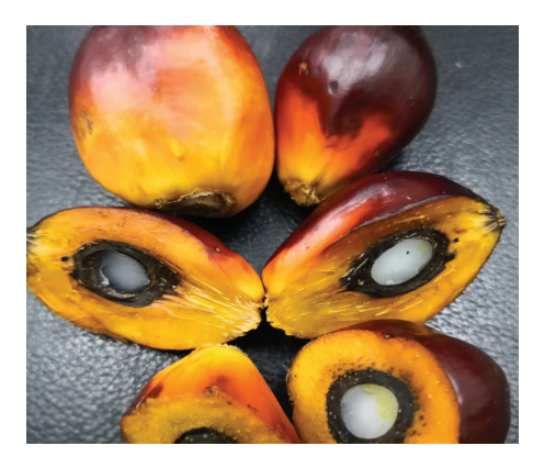
Figure 5a. Fertilised fruitlets: fully formed fruitlets with kernel and nut.