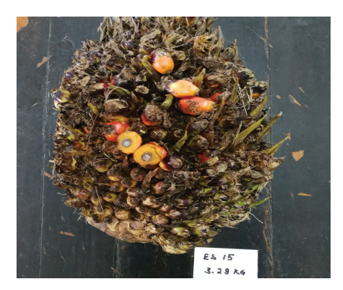
Figure 3a. Ripe oil palm fruit bunch with severe bunch moth infestation.