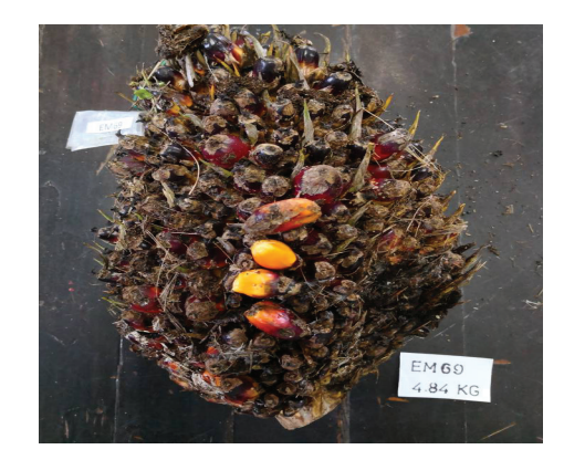
Figure 2a. Ripe oil palm fruit bunch with moderate oil palm bunch moth infestation.