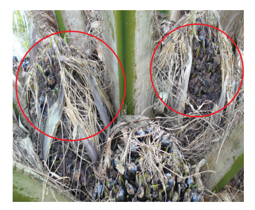
Figure 7b. Oil palm fruit bunches with severe old infestation covered by brownish black faeces (red circles).

in oil palm fruit bunches were 22 larvae in the severe category, 10 larvae in moderate category and two in light category ( Table 1 ).