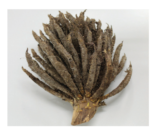
Figure 2b. Post-anthesis oil palm male inflorescence with moderate oil palm bunch moth infestation.