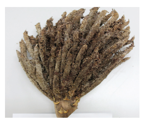
Figure 3b. Post-anthesis oil palm male inflorescence with severe bunch moth infestation.

average number of larvae present in each category. All fruit bunches and male inflorescences were dissected and the larvae residing in the sample were extracted. After each dissection, the sample was soaked in clean water for 5 min to capture the remaining larvae. Total number of larvae and their instar stages were recorded. The larvae count data were subjected to logarithmic transformation to normalise and after transformation, the larvae count data responded were subjected to analysis of variance using statistical analysis system (SAS) version 8.2.