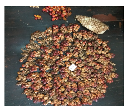
Figure 4. Spikelets of fruitlets after dissection.

Forty oil palm fruit bunches at their full ripening stages from each severity category, namely, light to clean, moderate and severe infestation were randomly sampled. The sampled bunches were weighed, dissected, and the bunch stalks were weighed. Then all the spikelets of fruitlets ( Figure 4 ) were counted for their fertilised ( Figure 5a ) and parthenocarpic fruitlets ( Figure 5b ) ratio. Percentage of fruit set, which is the percentage of the total number of fertilised fruitlets to the total number of fertile plus parthenocarpic fruitlets in the sampled bunch (Sugih et al. , 1996; Lawton, 1981; Harun and