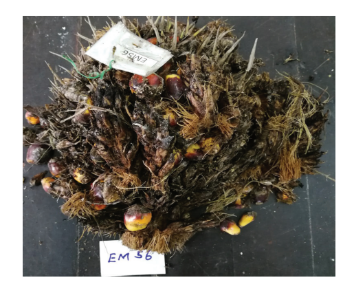
Figure 8. Aborted and rotten oil palm fruit bunch associated to severe Tirathaba mundella infestation.

become aborted due to destruction of the kernel. The fruit bunches in this severity category could continue to develop into maturity. The ripened bunches were with portions of undeveloped fruitlets and corky appearance as the outcome of mesocarp damage by the pest. For severely infested fruit bunches, the damage could lead to bunch abortion ( Figure 8 ), and put the bunch development to a halt.