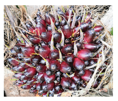
Figure 1a. Light to clean oil palm fruit bunch.

Thirty oil palm male inflorescences and 30 fruit bunches in each category (light to clean, moderate and severe) were further assessed to evaluate the