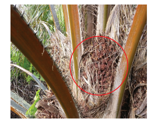
Figure 7a. Oil palm fruit bunches with severe new infestation covered by reddish faeces (red circle).

The severity of T. mundella infestation was classed into three categories and the number of pest larvae found in the inflorescences as well as the fruit bunches based on each category were determined. The mean number of larvae found per male inflorescence in severe category was 24 (rounded up figure), 11 larvae in moderate category and five larvae in light to clean category ( Table 1 ). The mean number of larvae found