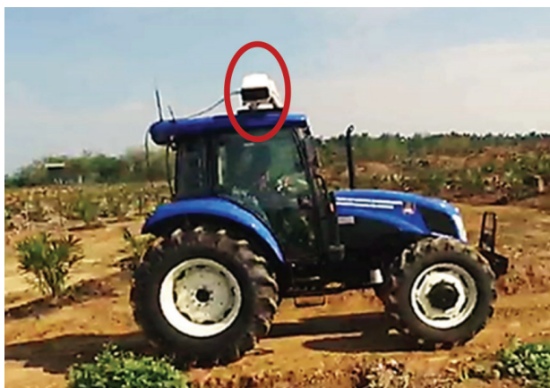
Figure 1. Autopilot tractor-mounted real-time plant N sensor.