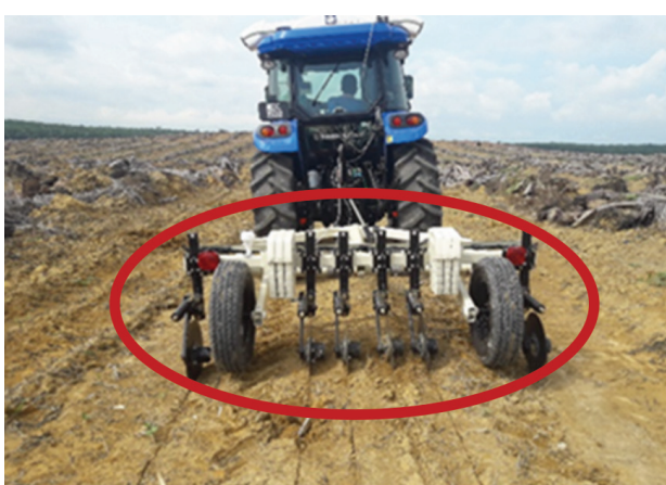
Figure 2. Autopilot tractor-mounted real-time soil EC sensor.

The data and required assumptions for cost calculation are presented in Table 1 . The initial price of all machine components was recorded from the bill of sale from the local machine suppliers in 2018. The values of economic life and hours of annual use of farm machinery in Malaysian oil palm plantations were based on a study by Samsudin et al. (2018). The salvage value was 10% of the initial price of the machine. Taxes, shelter, insurance and interest (TSII) cost was 13% of the value of the machine (Siemens and Bowers, 2008). The repair and maintenance factors (RF1 of 0.07 and RF2 of 2.0) were as quoted from repair and maintenance factors for two-wheel-drive (2WD) tractors according to the ASABE (2011). As the autopilot tractor used in this study was a medium-power tractor and operated in 2WD mode, hence, determining the fuel consumption of the tractor was referred to the reported data of 2WD tractor (Damanauskas and Januleviciu, 2015). Diesel market prices and labour wages were based on the economic situation in the country during the study.